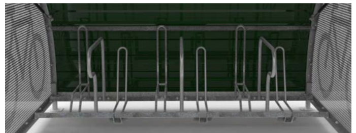
Space for 6 bikes with locking bar