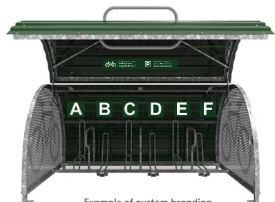
Example of custom branding