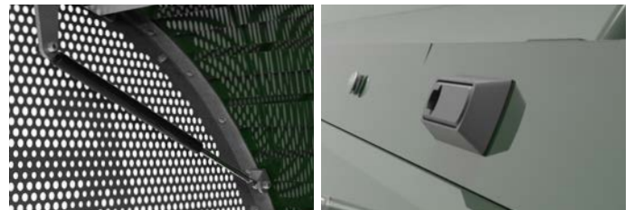
Gas sprung door