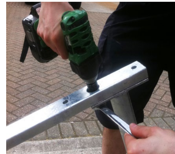
Step 2: Secure with the bolts provided using a 17mm spanner & socket wrench or impact driver.