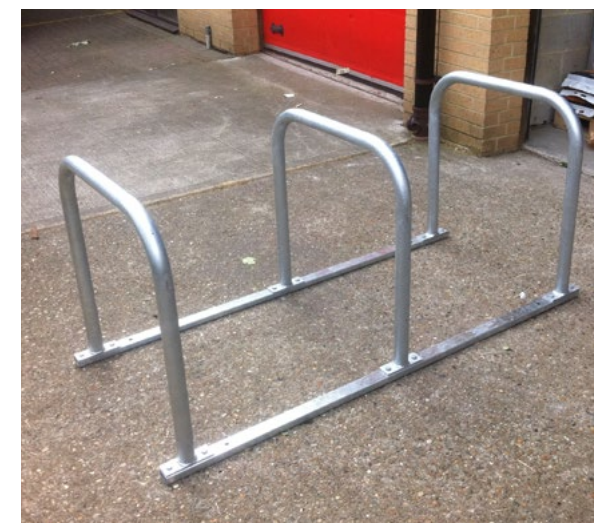
Step 4: Tighten all bolts and make sure the racks are secure and do not move.