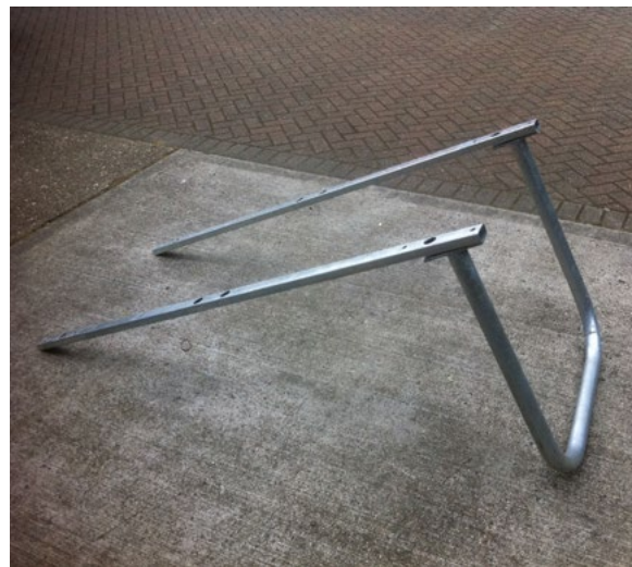
Step 1: Position the first hoop at the end of the two rails.