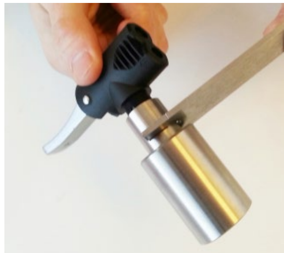
Step 3: Unscrew the pump head.