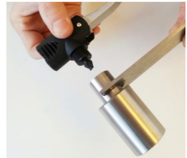
Step 4: Repeat the process the screw in the replacement pump head.