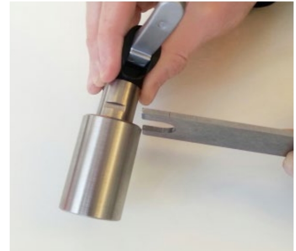
Step 2: Hold the pump head and fit spanner into the grooves.